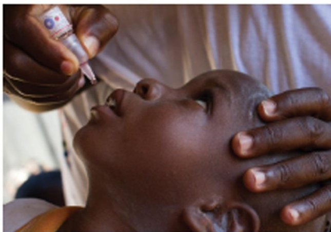
Rotarian administering polio vaccine in Nigeria, Africa

Our members’ and others’ contributions to the Foundation allow us to bring sustainable change to communities in need. Ask your club’s Rotary Foundation committee chair or visit rotary.org/donate to learn how you can support our Foundation. To learn more, download The Rotary Foundation Reference Guide or take the Rotary Foundation Basics course in Rotary’s Learning Center .